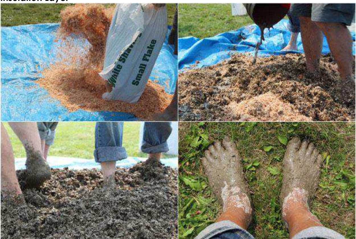
The purpose of this layer is to hold the heat of the thermal layer.

When coarse saw dust or wood shavings are mixed with just enough clay to hold the shape, and when they are exposed to the high temperature from the thermal layer, a new material-clay foam - is created. It's sort of a light weight charcoal-clay which is airy, thus conducts heat slowly.