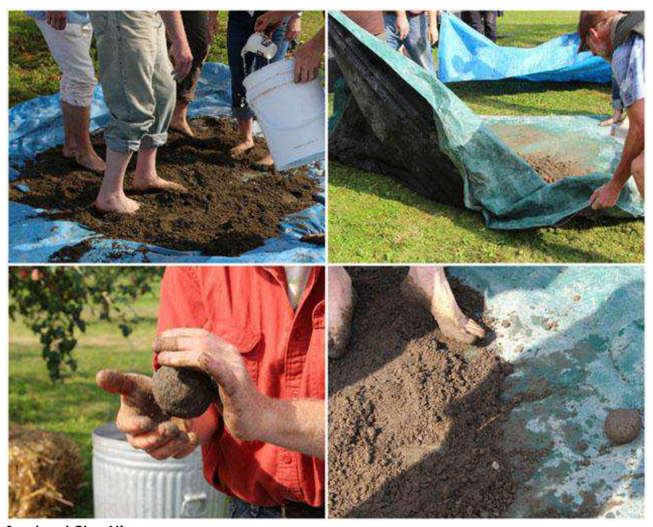
Sand and Clay Mix

How fun it is that our work is to dance in the mud?